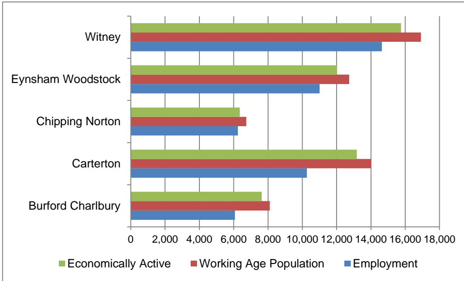
Figure 2 Economically Active and Employment by Sub Area (Number of People)