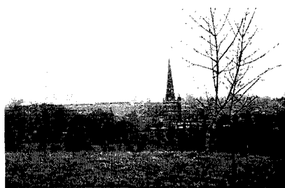
View of Burford from Fulbrook