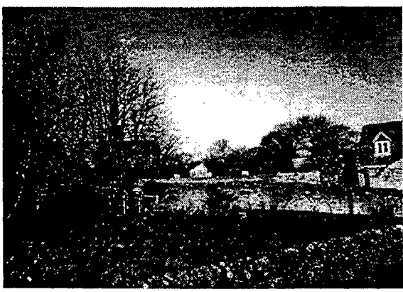
View of the western edge of Bampton