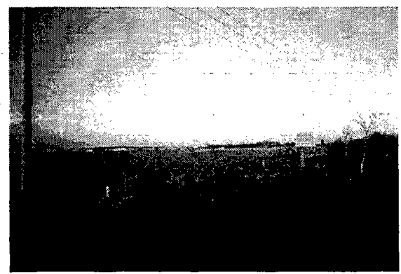
View towards Downs Road Industrial area from the link road