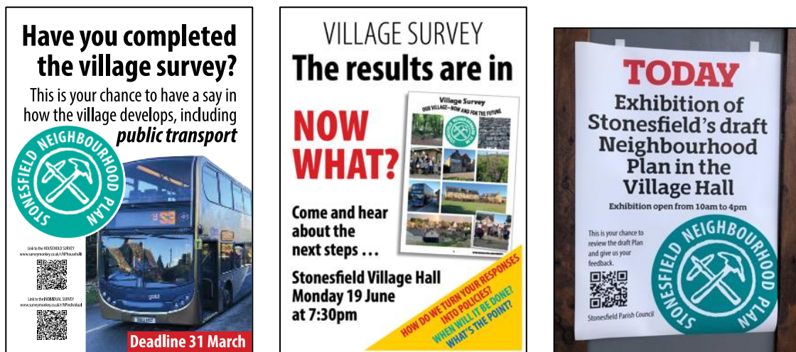
Figs CS 14, 15 & 16 – posters advertising the Village Survey, the second public meeting in June 2023, and the Exhibition of the draft Plan in March 2025.