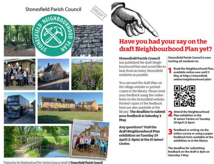
Fig CS 21 – a postcard produced and hand-delivered to every house in the parish, encouraging residents to read & comment on the draft Plan. one of three different postcards on different aspects of the Village Survey, produced and hand-delivered to every house in the parish, encouraging residents to complete it