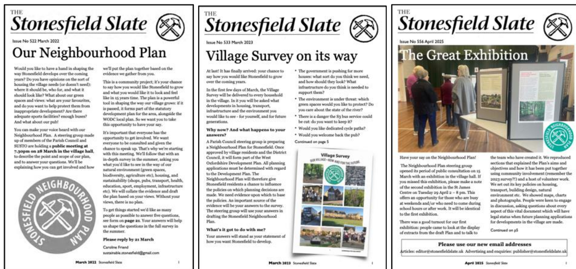
Figs CS 1, 2, and 3 – Front pages from The Stonesfield Slate