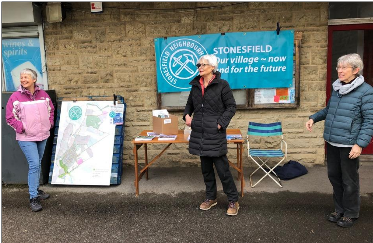
Fig CS 9 – Information stand outside Stonesfield's village shop, 25 March 2023