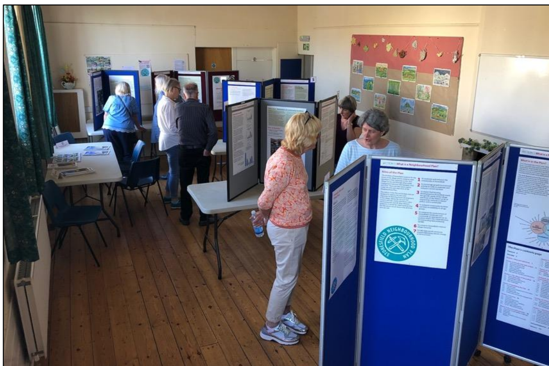
Fig CS 8 – Exhibition at St James' Centre, 29 April 2025