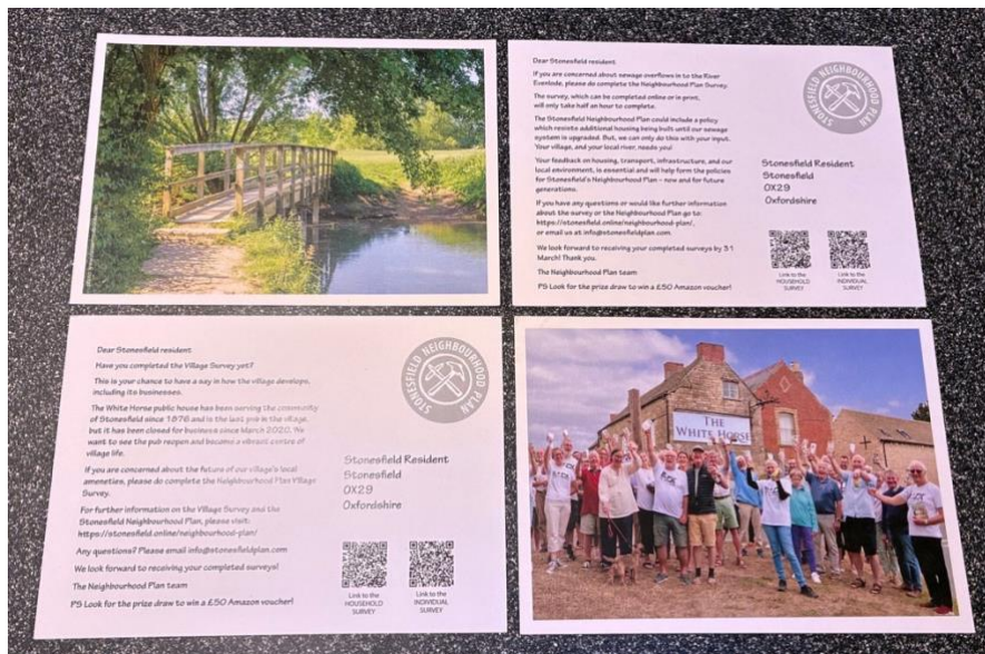
Fig CS20 – two other postcards produced and hand-delivered to every house in the parish, encouraging residents to complete the Village Survey..