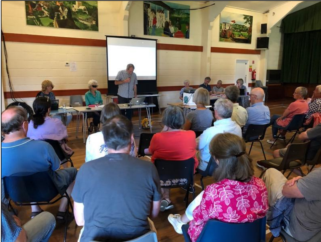
Fig CS 5 – The public meeting in June 2024