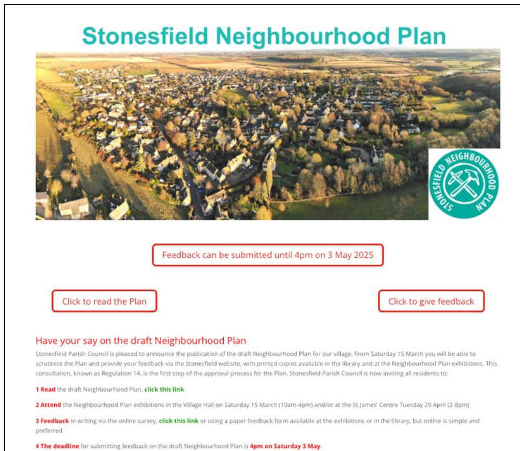
Fig. CS 4 – Stonesfield's Regulation 14 Consultation page on Stonesfield Online