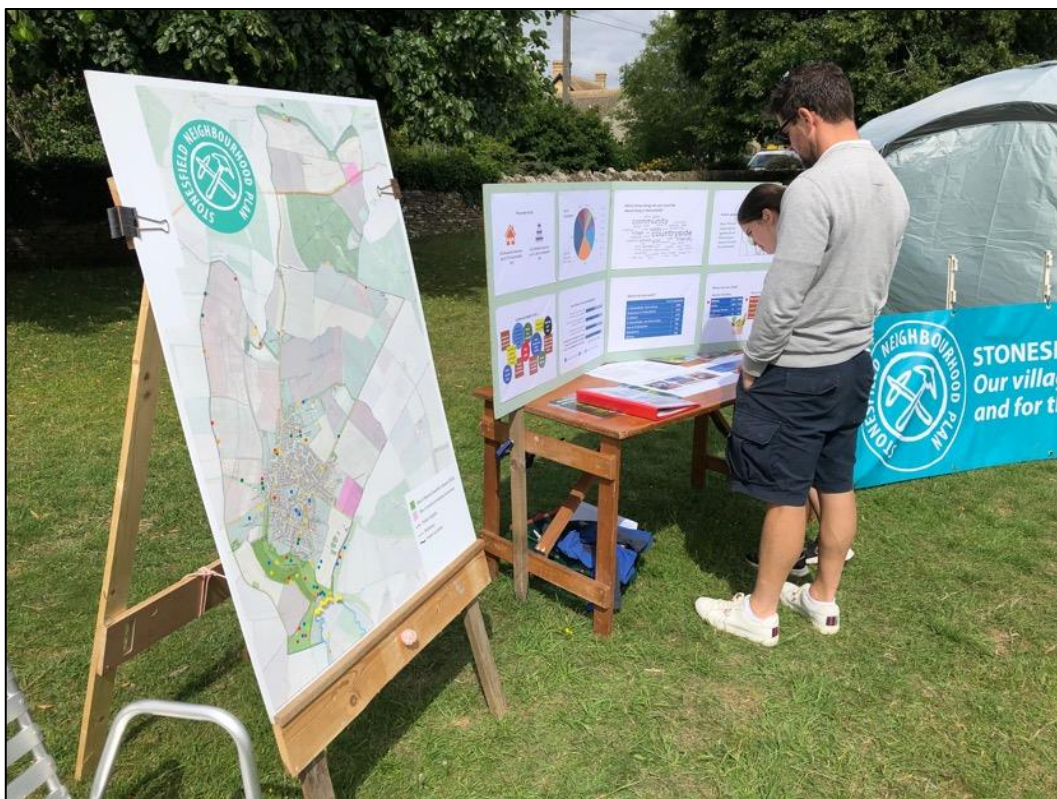
Fig CS 10 – Information stand at Stonesfield's school fete, 2 July 2023