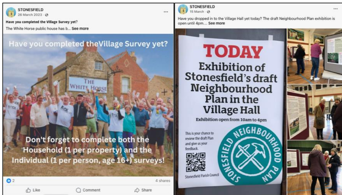
Figs CS 22 & 23 – Information posted on social media in March 2023 and March 2025