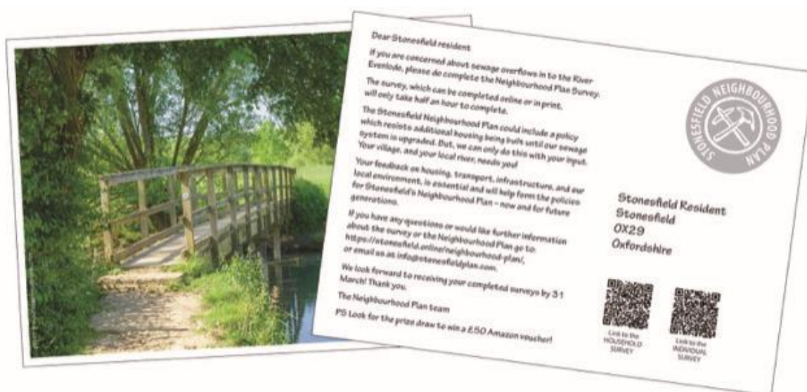
Fig CS 19 – one of three different postcards on different aspects of the Village Survey, produced and hand-delivered to every house in the parish, encouraging residents to complete it.