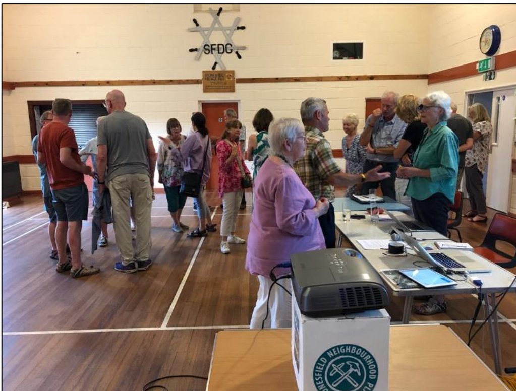
Fig CS 6 – The presentation after the public meeting in June 2024