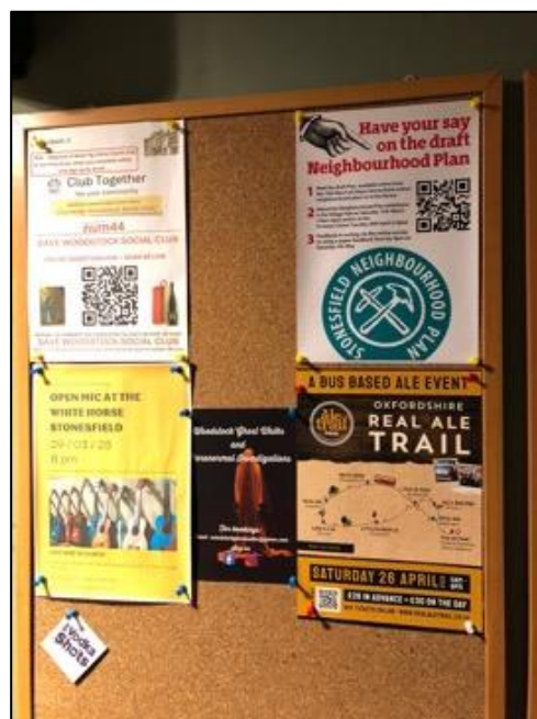
Figs CS 17 & 18 – posters in situ on a telegraph pole and in the White Horse pub encouraging residents to complete the Village Survey.