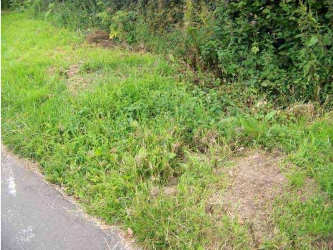
Overgrown grips leading to overgrown ditch - Poffley End Lane / Whitings Lane junction