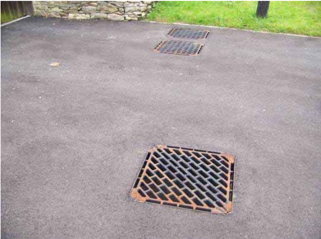
Poffley End Road; opposite to watercourse, drainage upsizing - private works on driveway