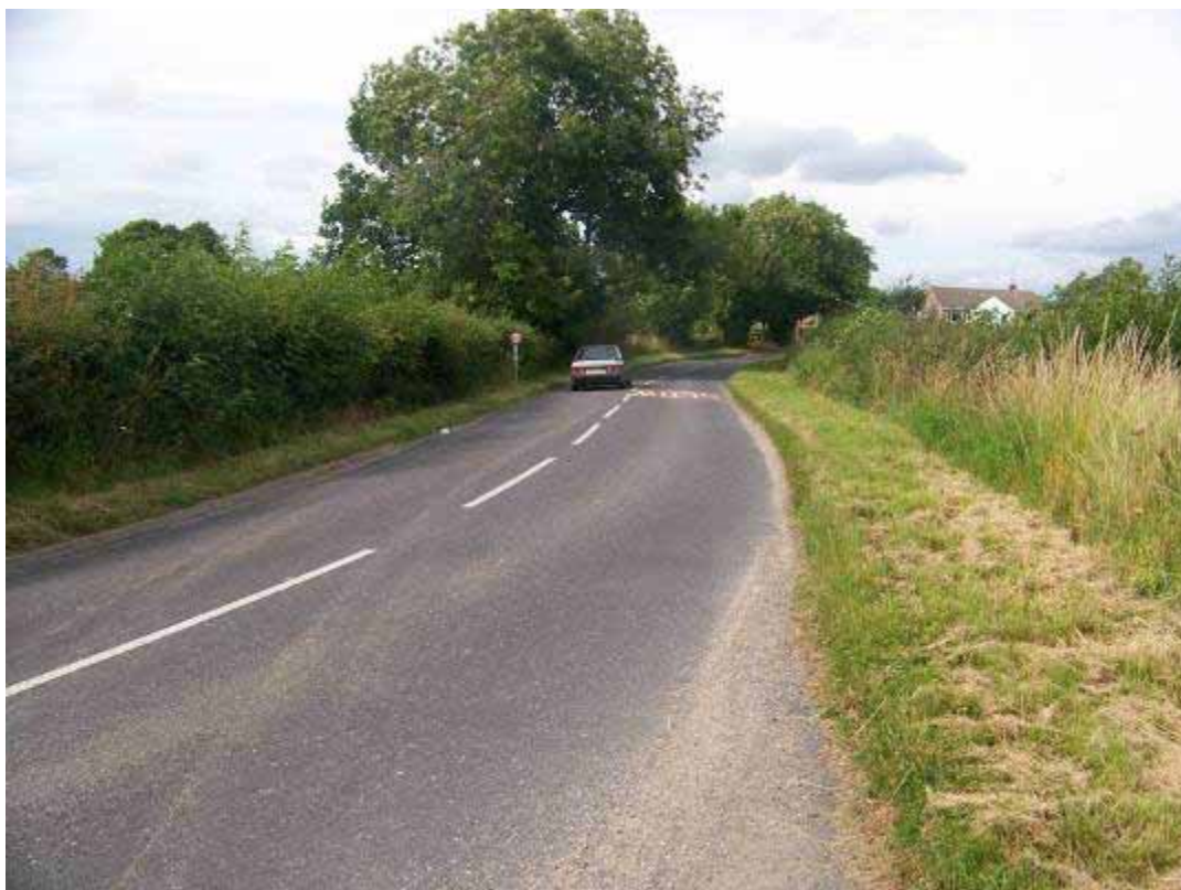
New Yatt Road – East of village, site of flooding and also potential for re-profiling of road surfaces