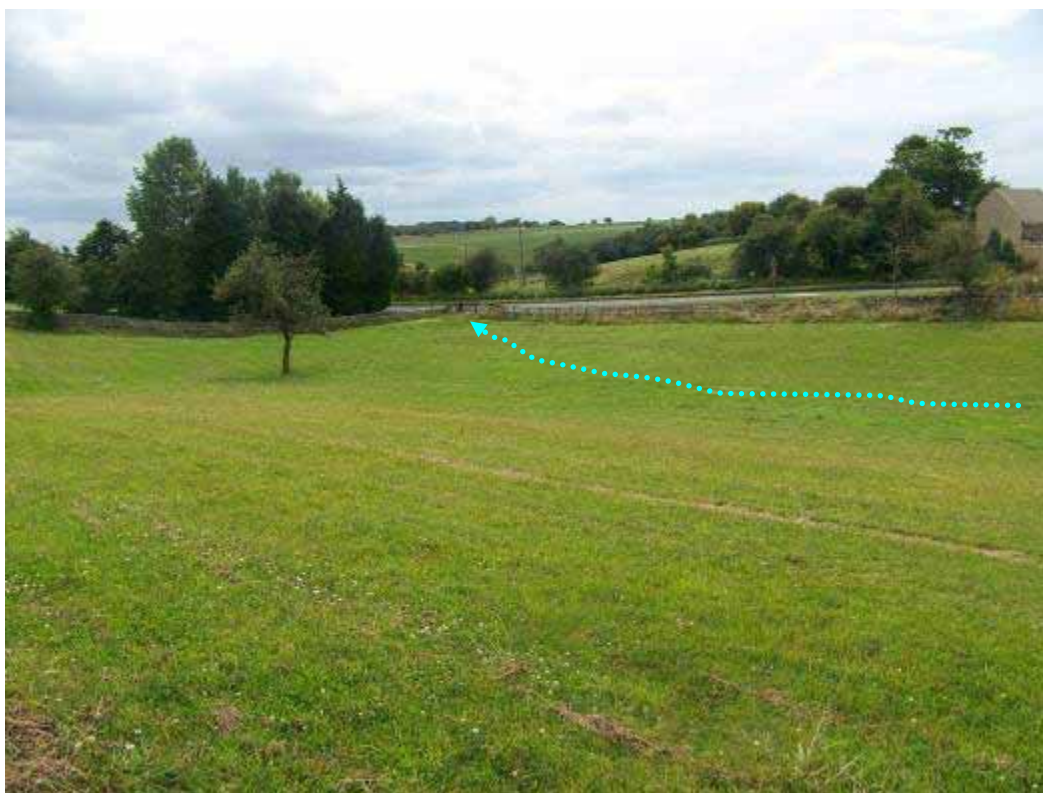
Looking down onto B4022 from private residence, flow path is shown – road was deeply flooded beyond gate