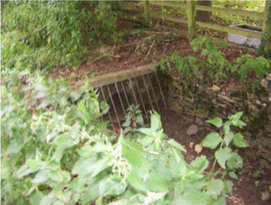
Wood Lane roadside ditch – Culvert entrance, route is under B4022 and west under riparian land for considerable distance. Outfall unknown – investigate as per Option B