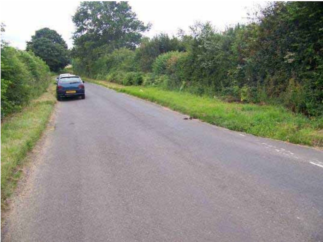
Looking towards Poffley End. Depth of water here was in excess of 1 metre