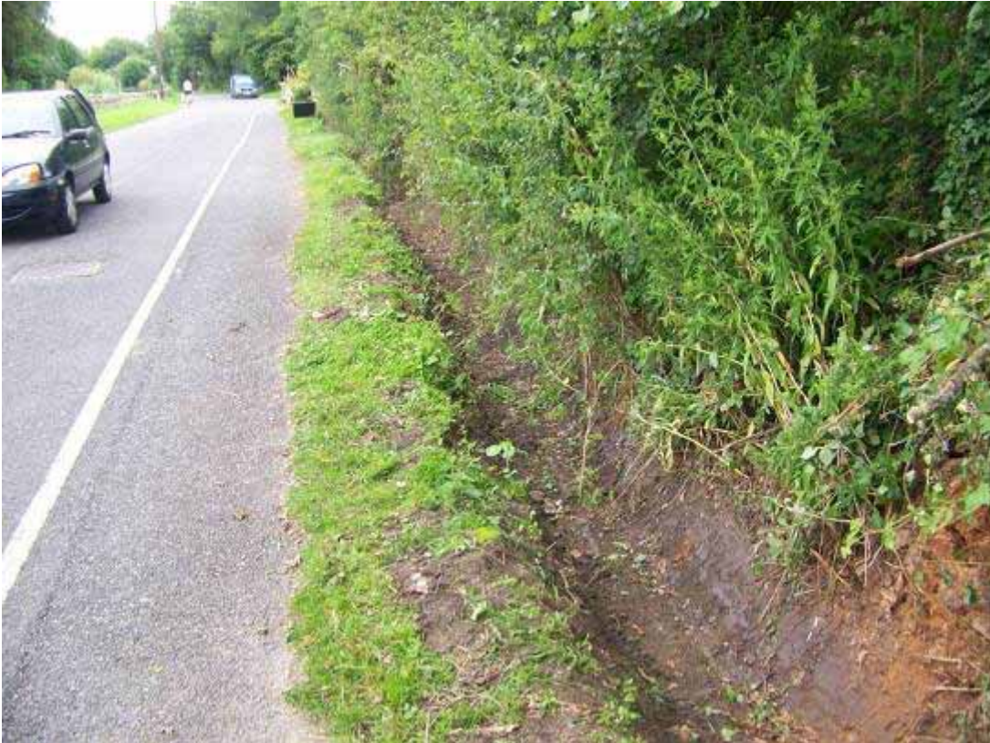
Poffley End Road – above inlet of site of recent OCC culvert upsizing works. Drain re-dug