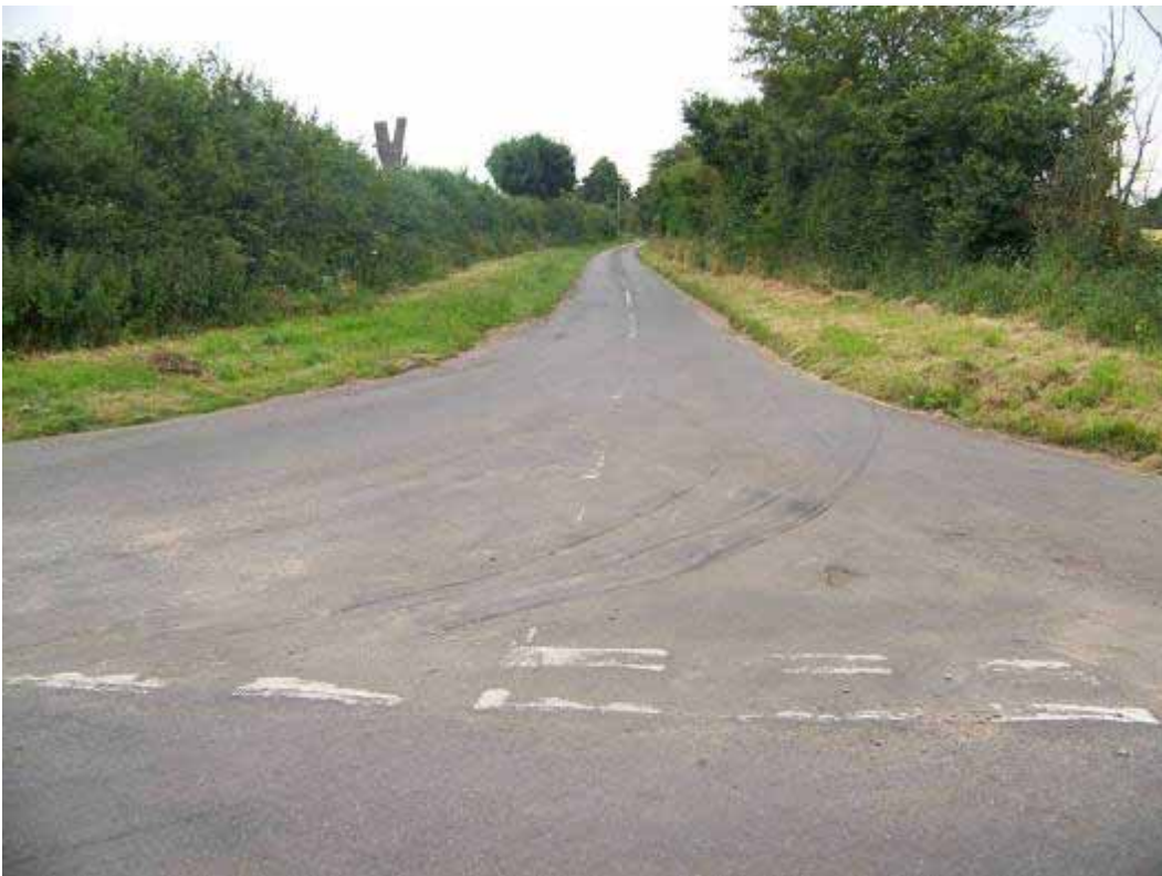
Common Leys - Poffley End Lane / Whittings Lane junction - Site of July 2007 flooding