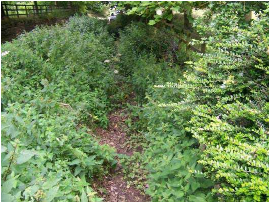
Wood Lane – roadside ditch looking west to B4022. Vegetation clearance required