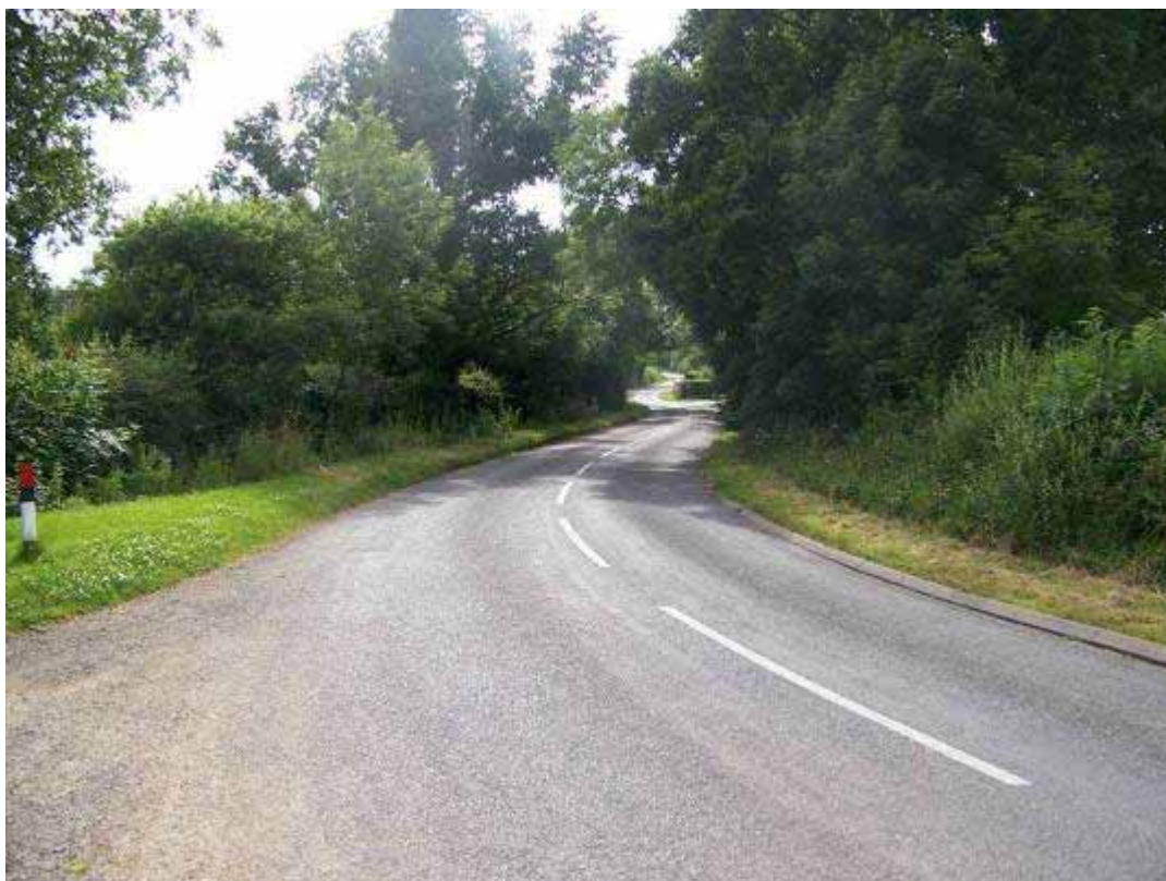
New Yatt Road – looking west into village