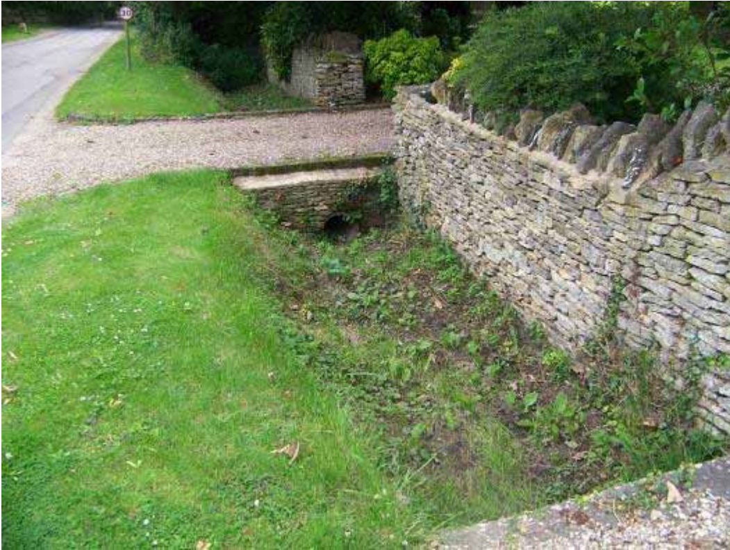
Wood Lane drainage ditch capacity much reduced by driveways – needs larger / double piping (Option B)