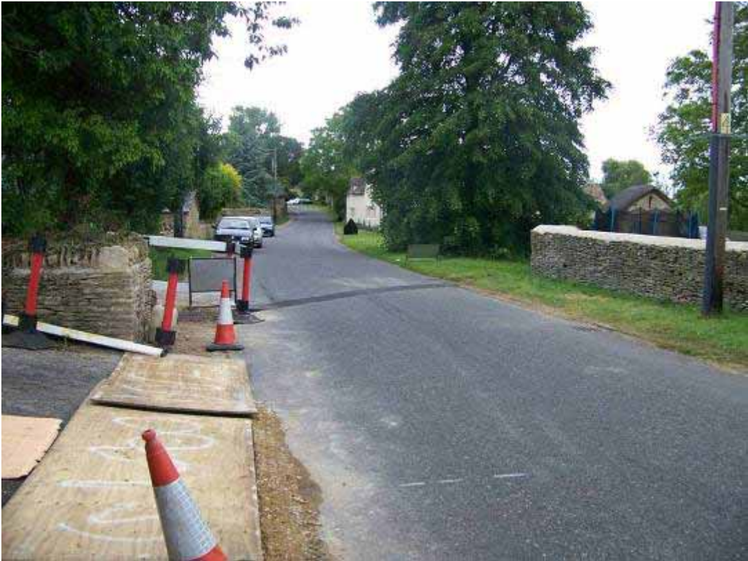
Poffley End Road – site of recent OCC culvert upsizing works