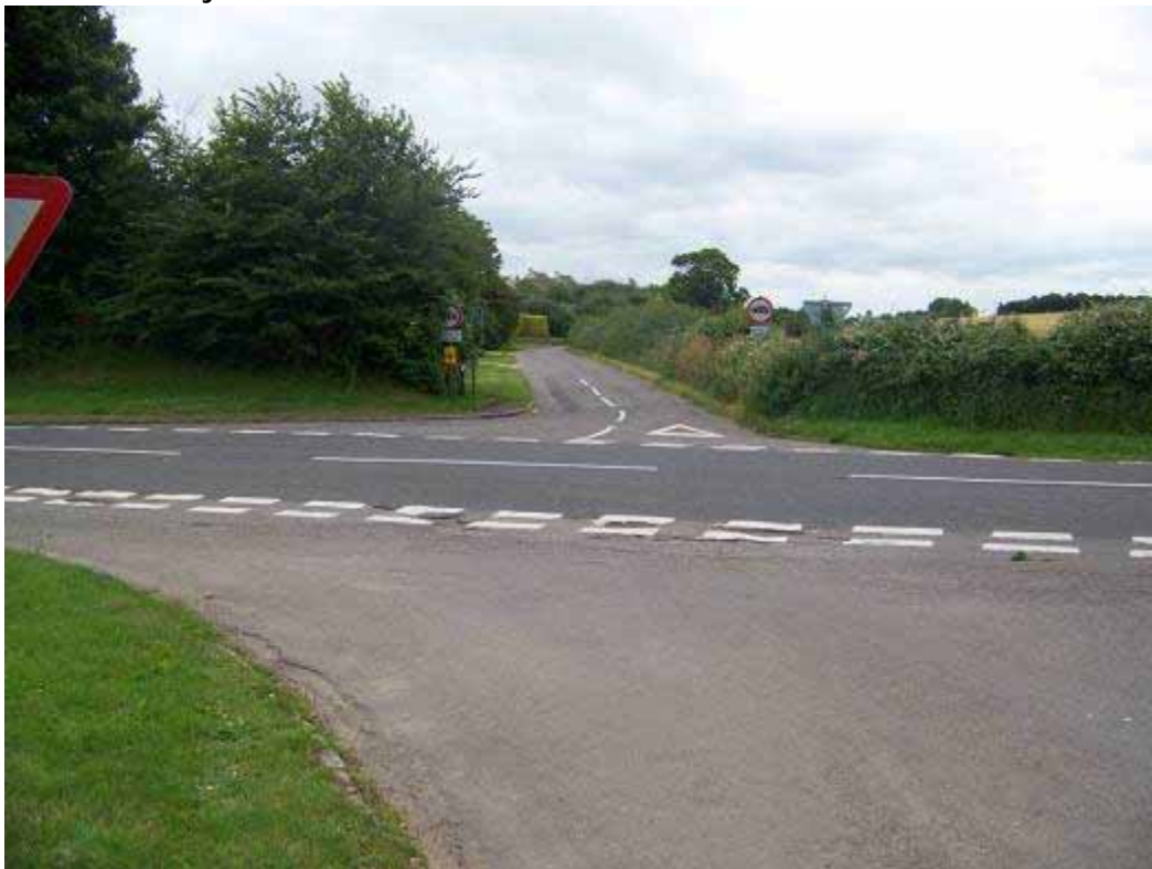
B4022 / Wood Lane junction - Site of July 2007 flooding