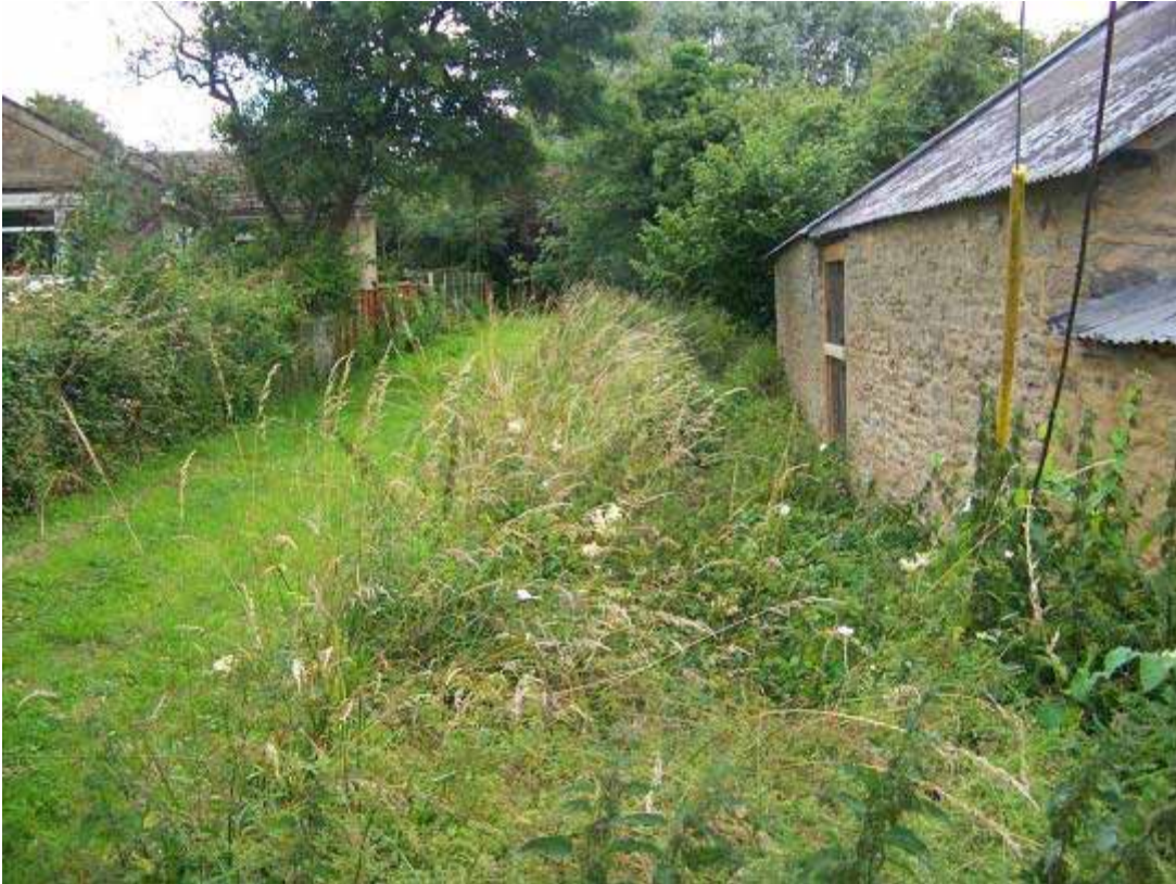
Poffley End Road – looking west along badly overgrown watercourse. Riparian land