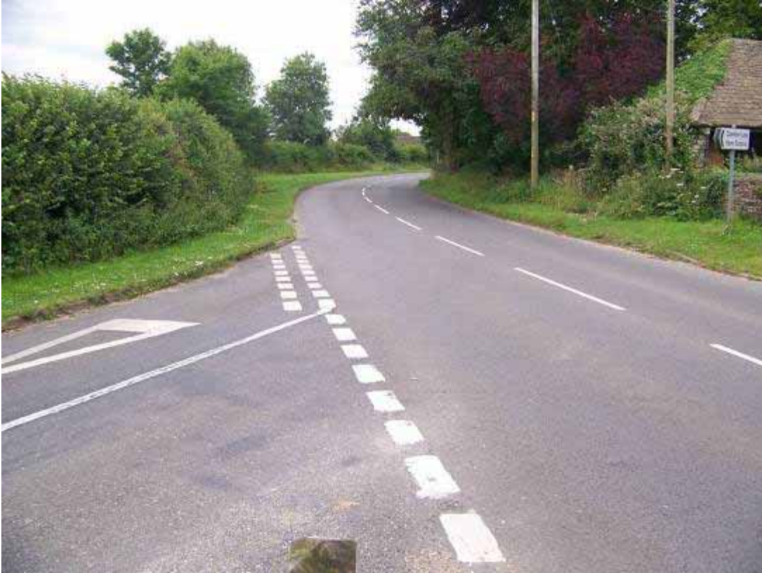
Poffley End Lane and B4022 junction – site of July 2007 flooding, very flat with small and infrequently spaced Gully pots